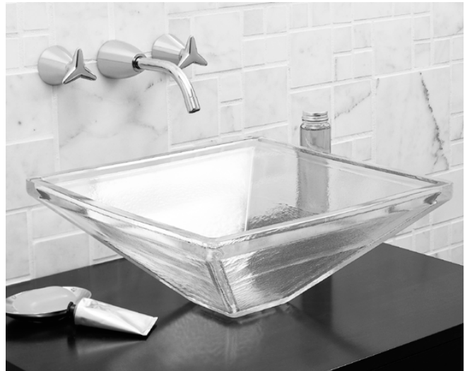
Shown with Stemma faucet (5339.451.002)